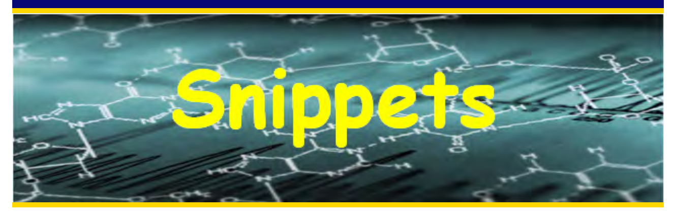
May 2014, Vol 14, No 5

This is the official e-news of Queensland Family History Society Inc