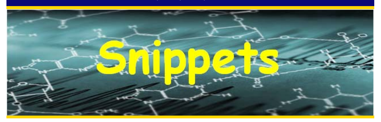
February 2014, Vol 14, No 2

This is the official e-news of Queensland Family History Society Inc