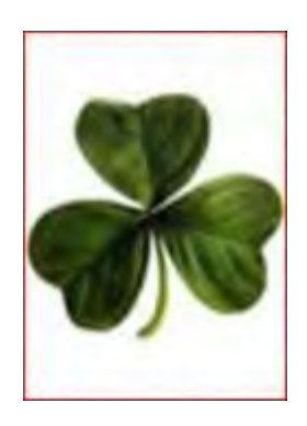
New Irish Research Resources