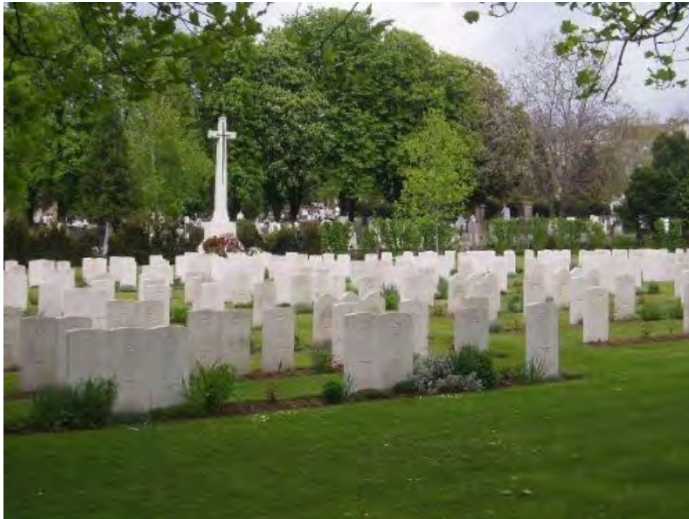
Belgrade War Cemetery 2005

year which will detail Bojan's research and experiences. It will include a recount of the special Anzac Day remembrance events in Serbia and Bojan's further research endeavours in Europe. Watch out for it as it's sure to be a fascinating account.