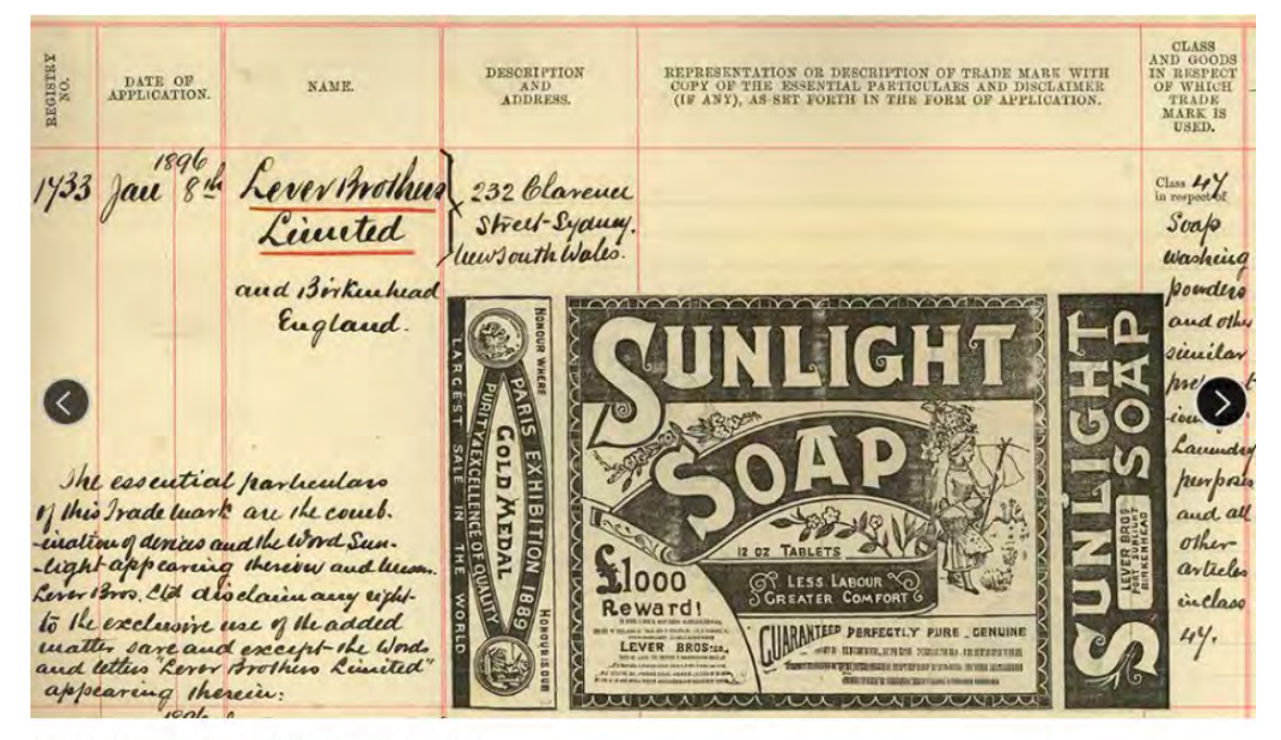
Sunlight Soap trademark, 1896. BP5/6, VOLUME 4

Speaker: Eve Terry (National Archives Australia)