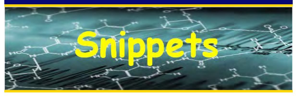
Special Snippets No 11

This is the official e-news of Queensland Family History Society Inc