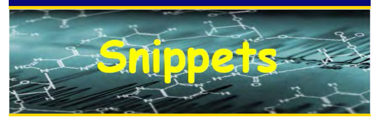
June 2018, Vol 18, No 6

This is the official e-news of Queensland Family History Society Inc