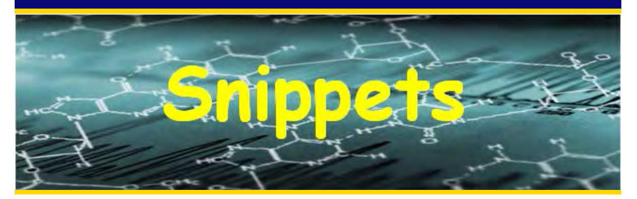
January 2017, Vol 17, No 1

This is the official e-news of Queensland Family History Society Inc