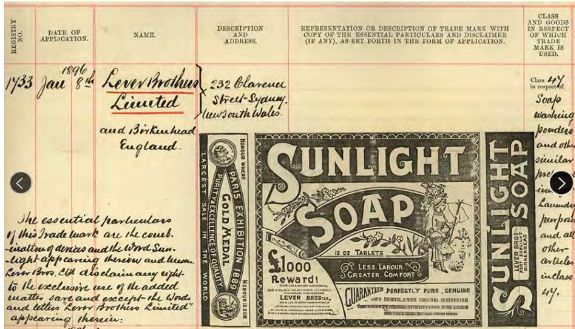
Sunlight Soap trademark, 1896. BP5/6, VOLUME 4

Speaker: Eve Terry (National Archives Australia)